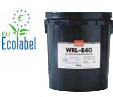
Environmentally Friendly Product